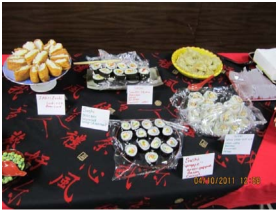
The food, prepared by members of the Board and Friends was おいしい ( oishii , delicious) and in addition to sushi, and gyoza, included curry rice, miso soup, a treat for those with a sweet tooth . . .