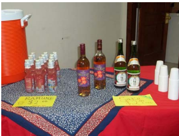
as well as, something to drink, of course.