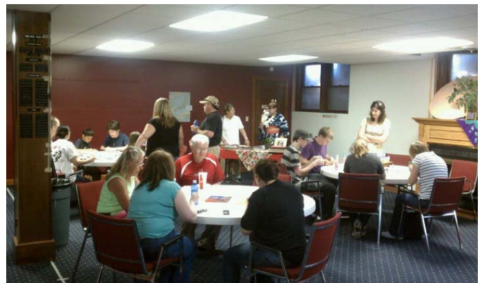
Attendees taking time to visit, fold cranes, view scrapbook about our Sister City, and eat.