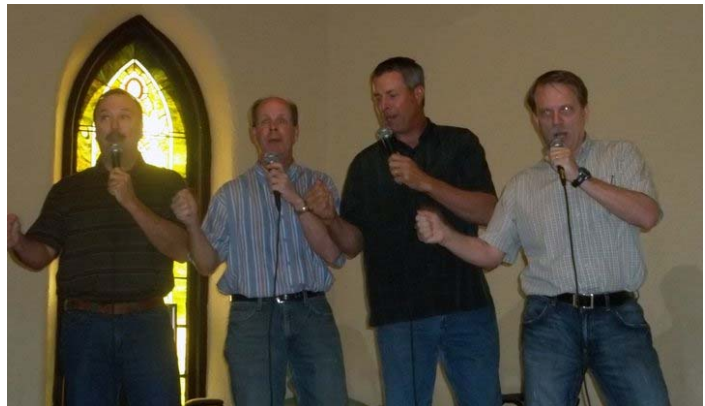
The Innermission Quartet