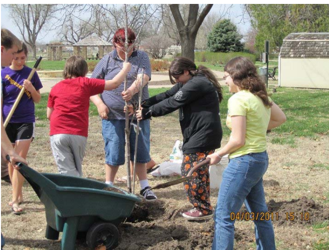
Members of Japan Club and 2010 delegates of Omitama plant the first tree.