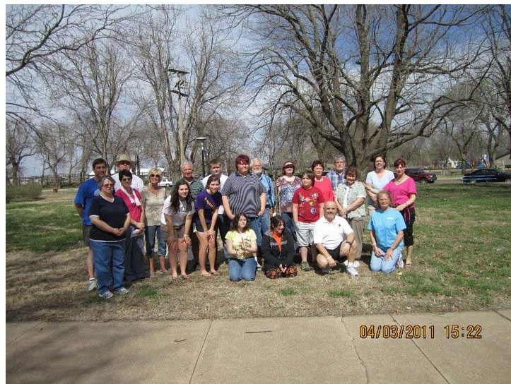
All our best to our friends in Omitama!

Tree Planting ... It was originally scheduled for Sunday, March 27 which turned out to be 32 degrees and snowing. Just one week later, April 3—92 degrees, bright and breezy, Friends of Sister City gathered for the ceremonial planting of the first of five flowering cherry trees. We plant these trees, not only in celebration of the 5th anniversary of the founding of Omitama, but also in commemoration of those who have lost so much, including their lives, and in gratitude for those who have given, and are giving, to help Japan blossom again.